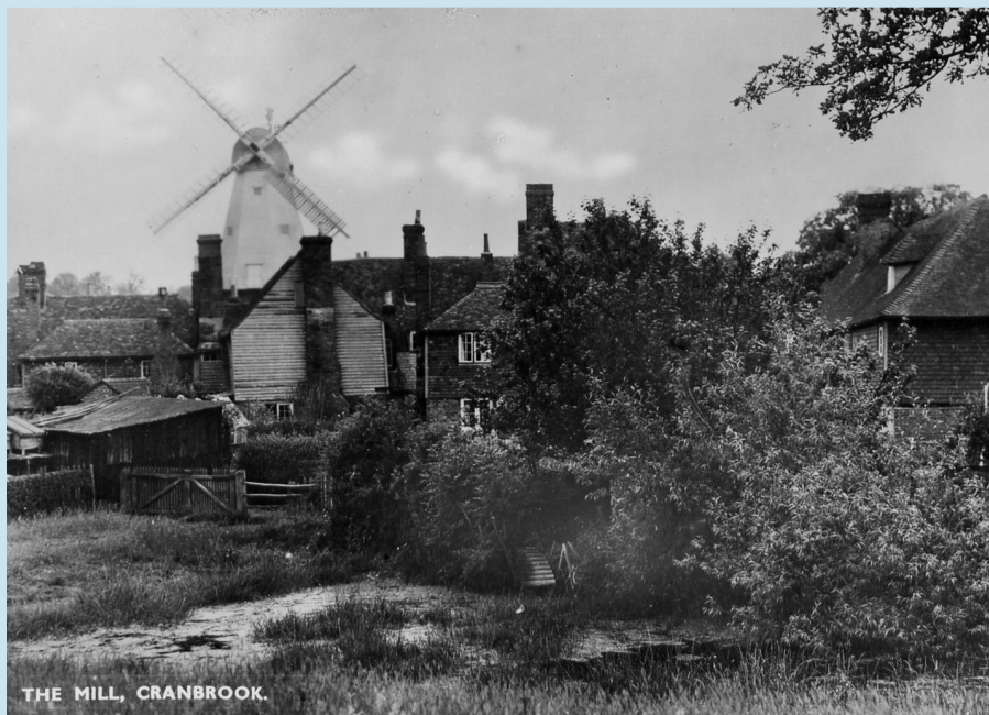
THE MILL, CRANBROOK.

Picture postcard of "The Mill, Cranbrook."