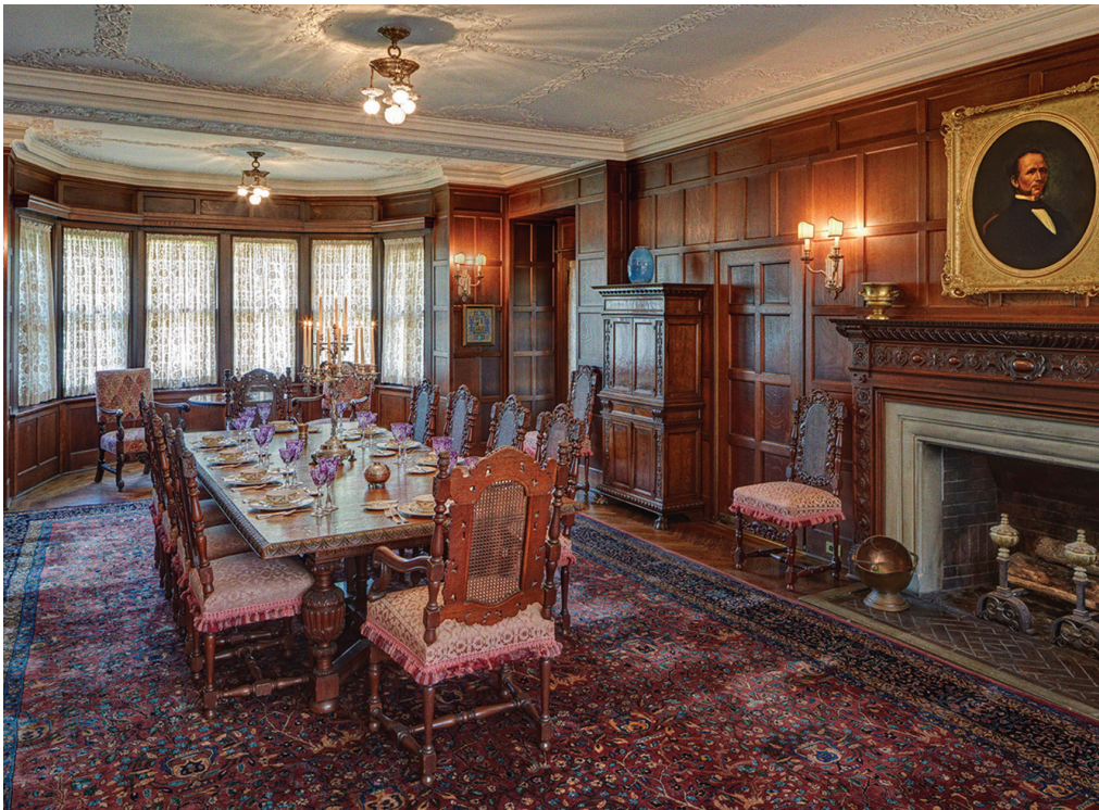
Cranbrook House Dining Room, 2018.

A detailed description of package inclusions and guidelines will be provided to the winner. Use of Cranbrook House has been generously donated by Cranbrook Educational Community. Includes a $1,500 gift certificate donated by Forte Belanger. Cranbrook Center for Collections and Research will provide the snack basket and ten tickets to the St. Dunstan's Theatre Guild performance of Kinky Boots on June 15, 2023. Cranbrook Center for Collections and Research will also cover the cost of passed white wine (red wine not permitted in Cranbrook House) and beer for dinner, along with non-alcoholic beverage service. A backup date of June 17, 2023, in the case of inclement weather, is in place for this experience.