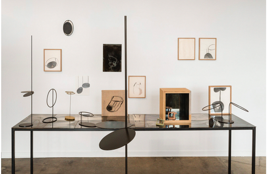
Iris Eichenberg, Real , 2015.