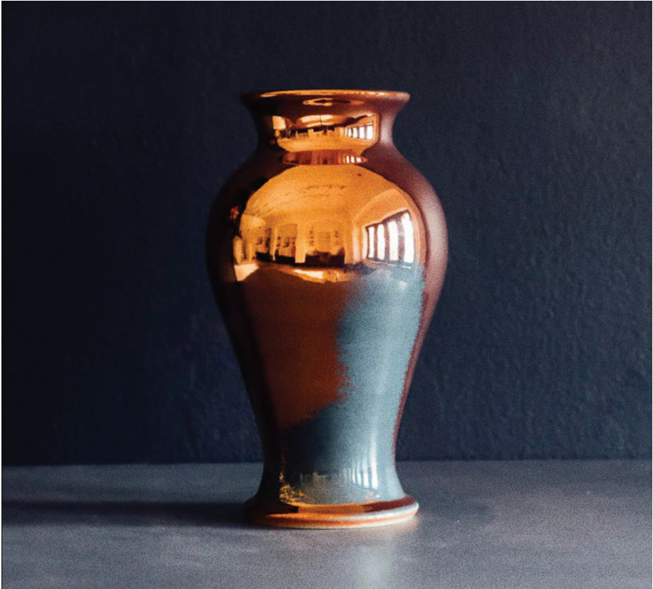
Pewabic Pottery, 2023.