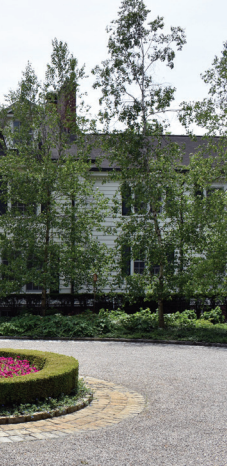
Highgate, September 2018.