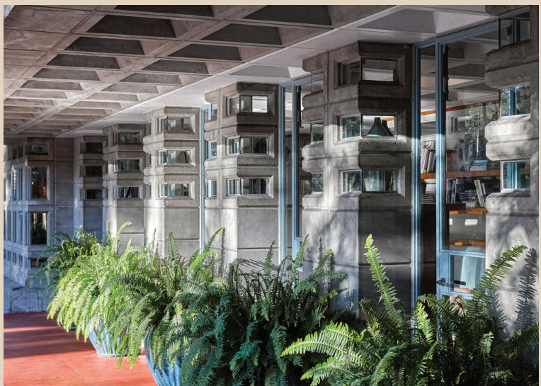
Dorothy G. Turkel House, 2015.